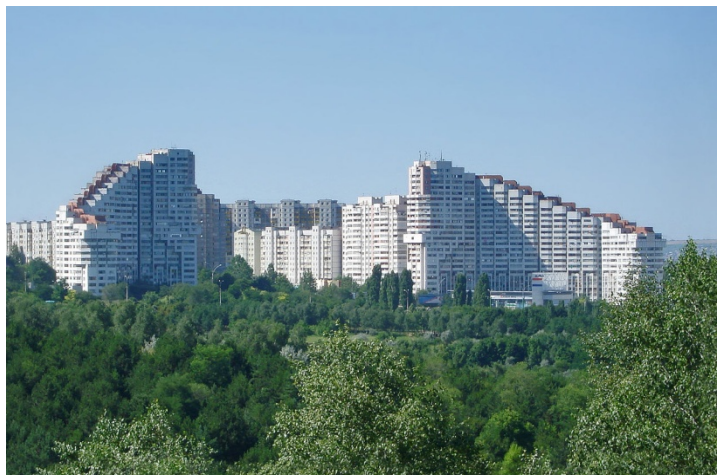
New buildings in Chisinau (capital)